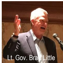
Lt. Gov. Brad Little

The next day, attendees were also honored to hear from Lt. Governor and Republican Gubernatorial nominee, Brad Little . Little is a former IACI Chairman and Harwood Award recipient. Little spoke of his desire to build upon successes of the past and ensure that Idaho's economic future stays bright. He discussed the future work that is needed and how Idaho should not rest on its laurels of previous achievements.